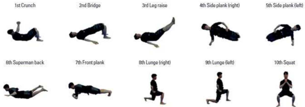
Fig. 2 Isometric exercises wore whole body-electromyostimulation (WB-EMS) suit.

their maximum tolerance (Bily et al., 2008).